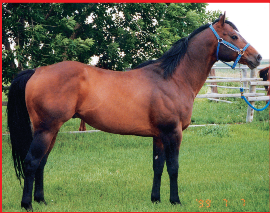
My Yankee Bug, foaled in 1987 out of Flick Bug, stands at Mike Harrigfeld's Flying 7 Ranch in Iona, Idaho. The stallion is by On A High (Dash For Cash x Yankee Doll (TB)).